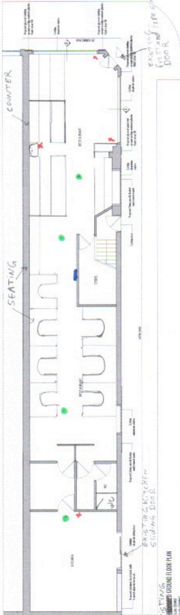
EXISTING PROPOSED GROUND FLOOR PLAN Scale: 1:50 Date: 15/08/2018

X Fire Extinguisher ● Fire Sensor — Fire Alarm Board